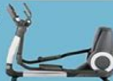
EC-1450 20-24 inch