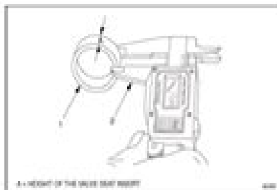
Figure 10. Measuring the Weight of the Valve Seat Inset