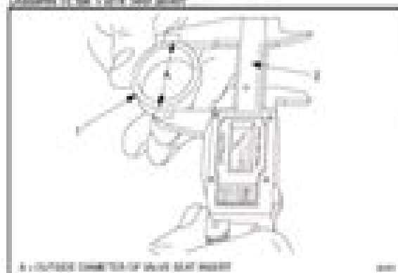
Figure 11. Measuring the Outside Diameter of the Valve Seat Inset