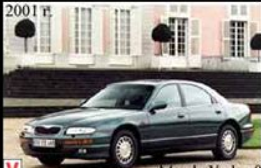
Mazda Xedos 9