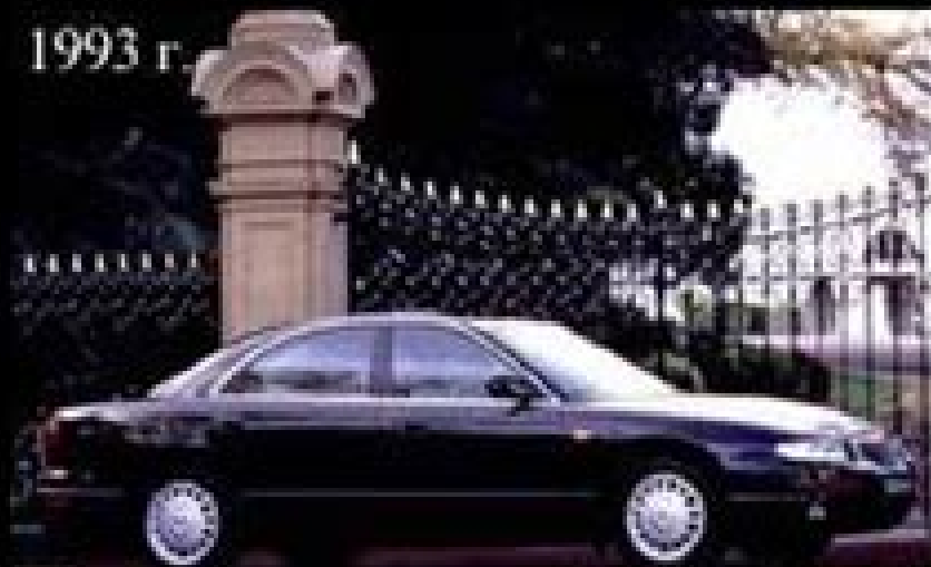
Mazda Xedos 9