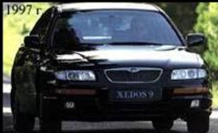
Mazda Xedos 9