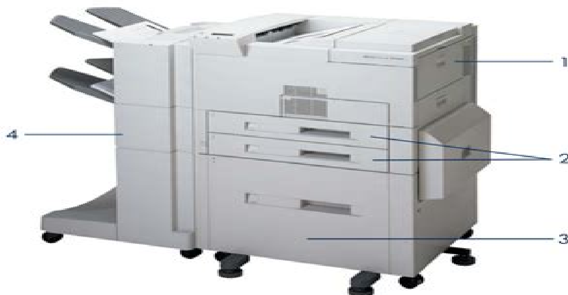
HP LaserJet 8150dn model shown