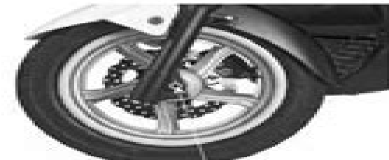
Front Axle Nut