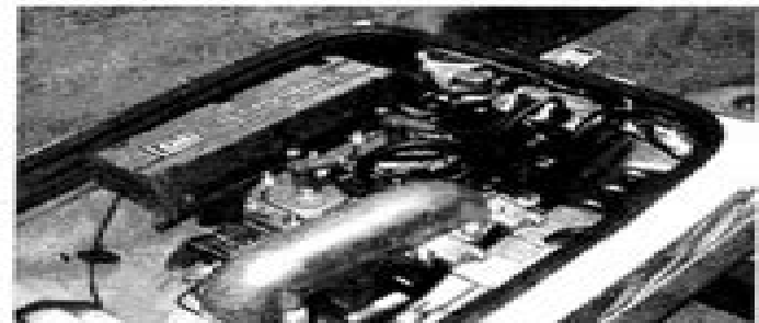
Overall view of the popular Model 750 Series twin cylinder installation.