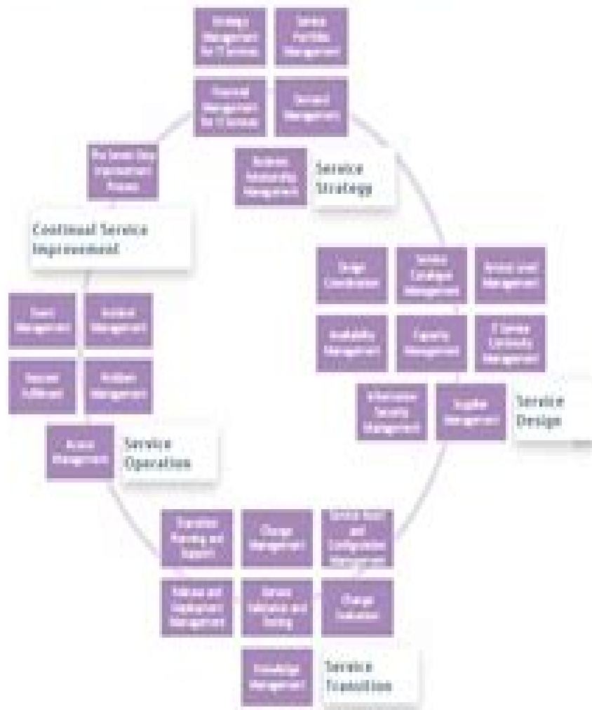
ITIL® V3 26 service lifecycle processes