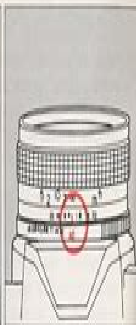
4. Set lens to AE posi- tion. (P.15)