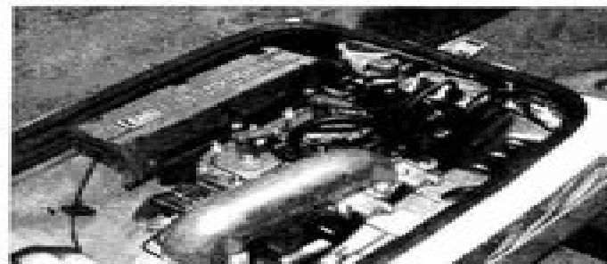
Overall view of the popular Model 750 Series twin cylinder installation.