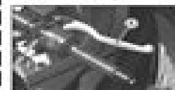
A. Proper Braking Lean

Warning: It is better to avoid braking to the right application of both brakes or not to brake at all. Reduce your speed before you get into the corner. For emergency braking, disengage the clutch, and concentrate on applying the brakes as hard as possible without skipping.