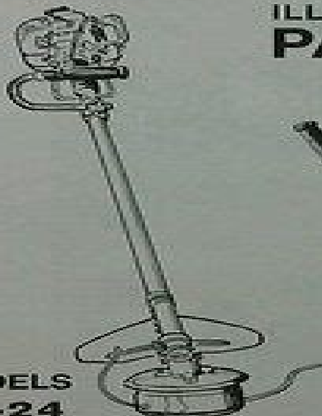
MODELS HK-24 STRING TRIMMER/BRUSHCUTTER UT-18001