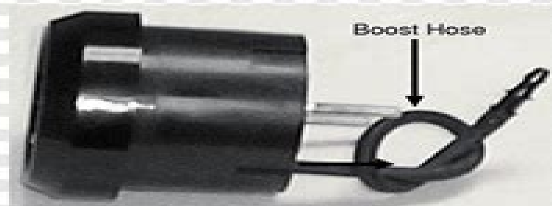
Figure 3. Boost Hose

The boost hose protruding from the back of the gauge is connected to the on-board pressure sensor. See Figure 3. When using the on-board pressure sensor, the boost hose must be connected to manifold pressure. Connect the boost hose to manifold pressure using the supplied tubing and 1/8" NPT barb or an existing manifold pressure port. (NOTE: Do not pull on the boost hose) See Figure 4 for a connection diagram.