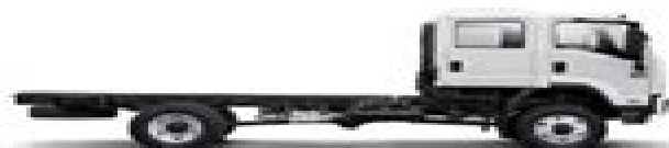
FTS 800 Crew