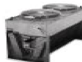
URC-24F Remote Condenser