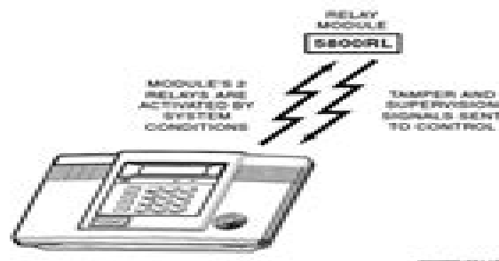
Figure 1. Lynx Interface Diagram

The ADEMCO 5800RL is a Wireless Relay Module that enables use of remote sounders and/or remote arm/disarm indicators using two relays activated by wireless signals from the LYNX control (see Figure 1). The 5800RL can also send tamper and supervision signals to the LYNX if so programmed. The 5800RL is compatible with LYNX controls having software versions 9.0 or higher. Refer to the LYNX control installation and setup guide for software compatibility and zone programming information.