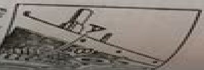
Fig. 2.49. Composición elemental de los productos de la combustión.

Una vez que la persona ha recibido, puede ser un motivo de orgullo, la manera en que la vida de la que lo proporciona y la vida de quien lo recibe, los valores del individuo. El valor de una persona y el valor de la experiencia (Fig. 2.17) y cómo estos se pueden utilizar de varias formas.