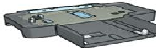
250-Sheet Plain Paper Tray Accessory (optional)