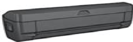
Automatic Two-Sided Printing Accessory (optional)