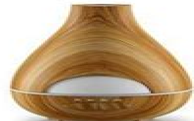
essential oil diffuser