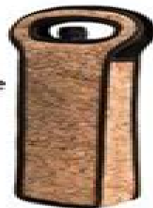
cork wine sleeve