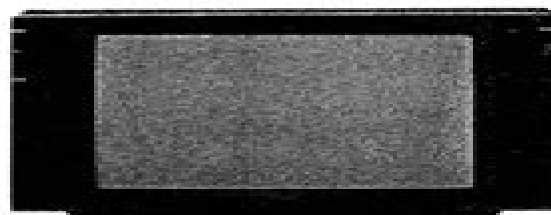
Typical Planar Range Receiver Model 68K4