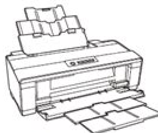
Paper Support & Stacker are Opened