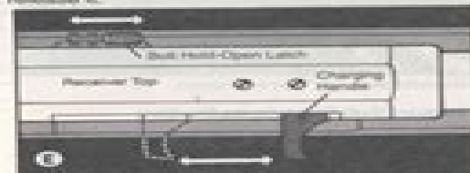
Push bolt hold-open latch forward.

Push the charging handle all the way back, and hold it there. To close the bolt from the manual hold-open position, remove the magazine and push the bolt hold-open latch as far forward as it will go (See E). Then, pull the charging handle back and release it.