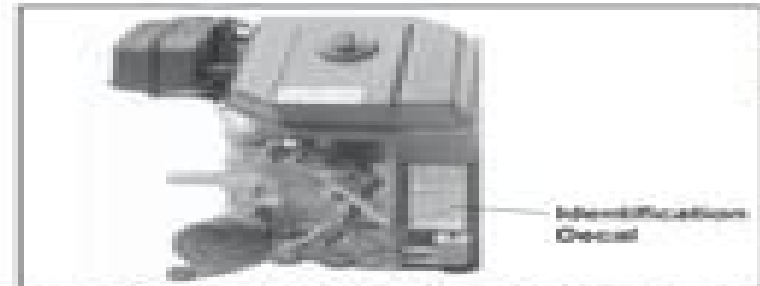
Figure 1-1. Engine Identification Decal Location.

The engine identification numbers appear on a decal, or decal, affixed to the engine structure. See Figure 1-1. An explanation of these numbers is shown in Figure 1-2.