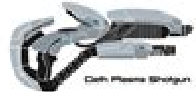
Cath Plasma Shotgun