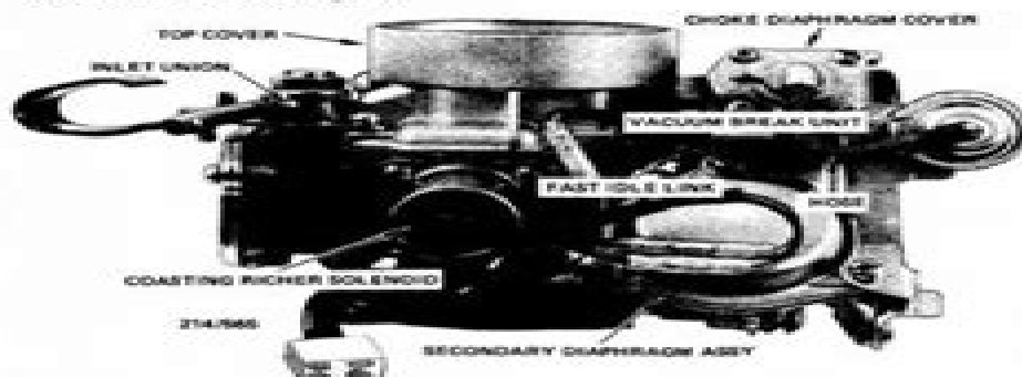
View of coasting richer solenoid side of carburettor.

A throttle return dashpot has been fitted to manual transmission vehicles to prevent high emission levels during engine overrun. When the accelerator is released the throttle lever contacts the dashpot diaphragm and is then restrained to close the throttle valve slowly by the action of the dashpot.