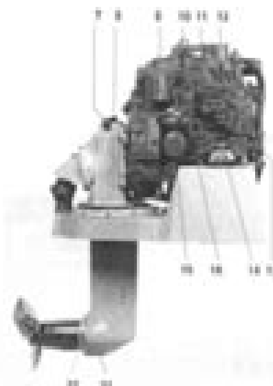
MD2012AB & MD20