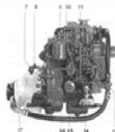
MD2012AB & MD20