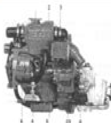
MD2012AB & MD20