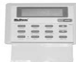
Wired Wall Control (Optional)