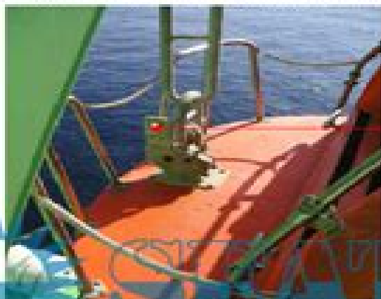
Boat strong point

Secure one end of the wire to the boat strong point, the other end of the wire to the davit strong point. Lower the boat till the boat is on the wires.