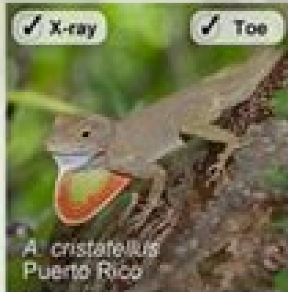
A. cristatellus Puerto Rico