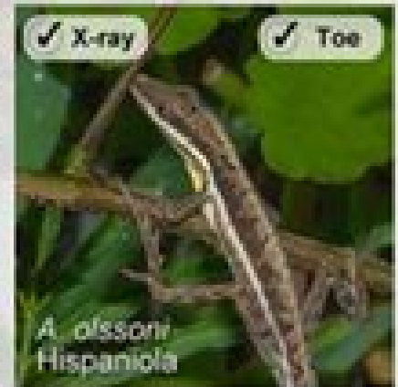
A. olssoni Hispaniola

Press each lizard photo above to measure. You can review how to take measurements by pressing on the "Tutorials" tab.