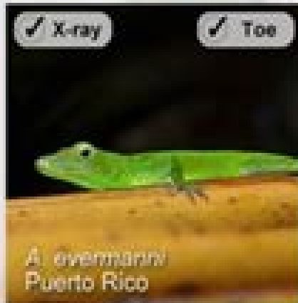
A. evermanni Puerto Rico