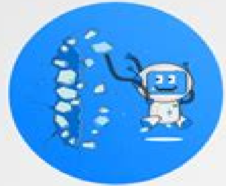
Breaking Language Barriers