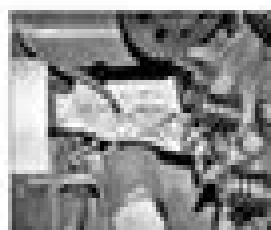
4.12 Push water draining bolt - proceed