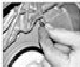
15.13a Fit the shims back into position