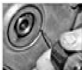
15.1b ... on both the seal and fit a screw