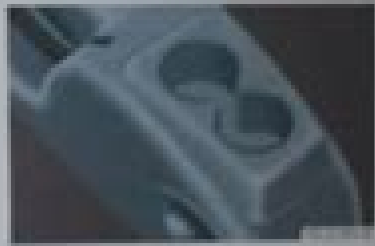
Top Shifter is the center console.

Always use proper technique for the vehicle's intended use. Always use proper technique for the vehicle's intended use. Always use proper technique for the vehicle's intended use.