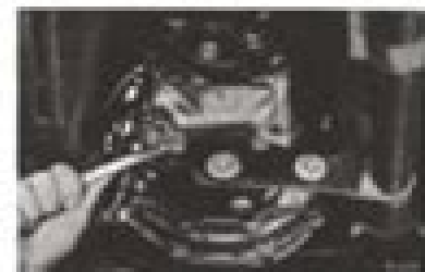
Fig. 3.6 Mounting the colored paper support (back) on the neutral gray-tones