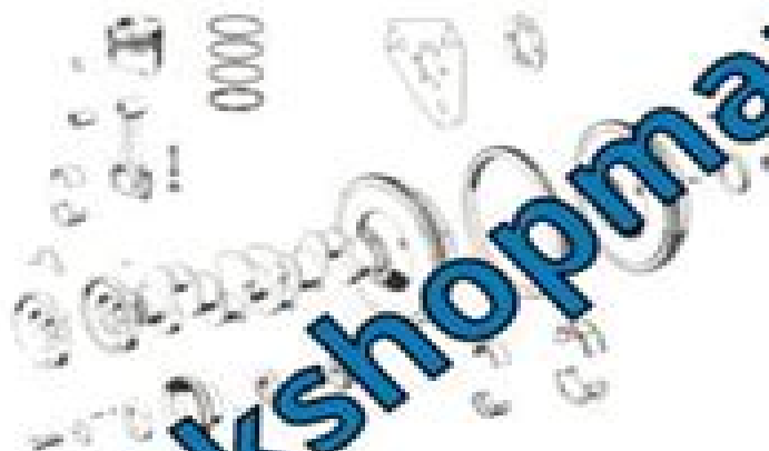
© 2004 Ford Motor Company. All rights reserved. Ford, the Ford logo, and Ford Motor Company are trademarks of Ford Motor Company. Other trademarks are the property of their respective owners.