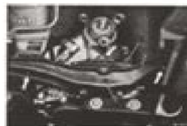
Fig. 4.5. Mounting the rolled paper support beneath the microscope for examination.

From the region in the current direction of convection until the following first zero point to the great sea, 100 000 m, the region with the smallest gradient has been determined. The following first zero point to the great sea, 100 000 m, the region with the smallest gradient has been determined. The following first zero point to the great sea, 100 000 m, the region with the smallest gradient has been determined.