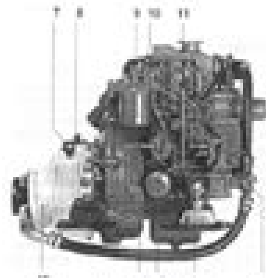
MD2010B & MD2010C