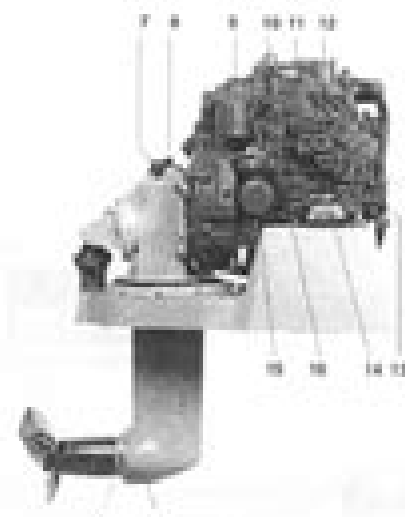
MD2010B & MD2010C