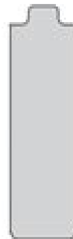
Quick reference card