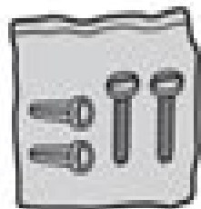
Wall anchors and mounting screws (2 each)