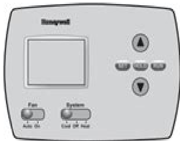
PRO TH4110B digital thermostat (wallplate attached to back)