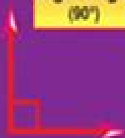
Right Angle (90°)