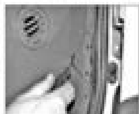
11.53 Using a small screwdriver, release the bolt covers from the face on both sides