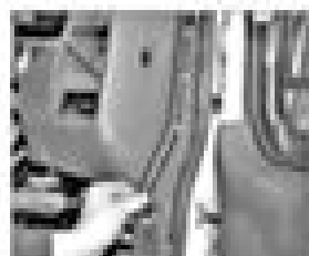
11.52 Release the retaining clip and remove the head from the face on both sides