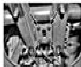
11.51 Undo the six bolts (previously securing the head) using the mounting bracket in the block