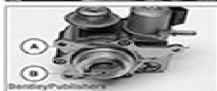
High-pressure fuel system service on turbo engine, including replacing high-fuel pump, N56 Fuel Tank and Fuel Pump