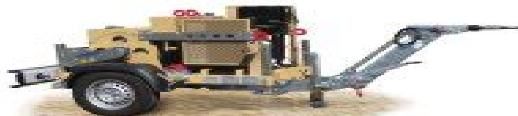
AMC402 with ALL112

Hydraulic winch designed for tower erection, for stringing operations of low and medium voltage overhead lines and for any lifting work.