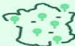
Fonction publique territoriale