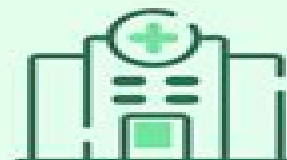
Fonction publique hospitalière

Pour garantir l'égal accès à la fonction publique, il est recruté par concours (sauf exceptions).