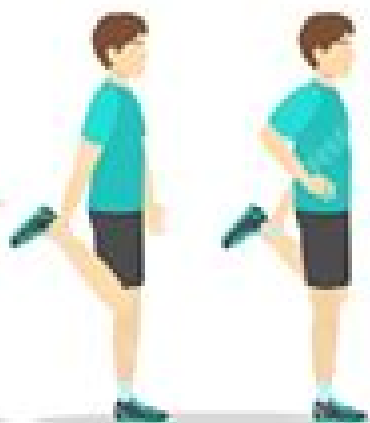
8 QUADRICEPS STRETCH