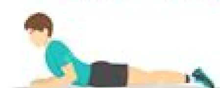
9 COBRA POSE