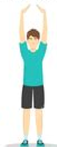
4 OVERHEAD STRETCH