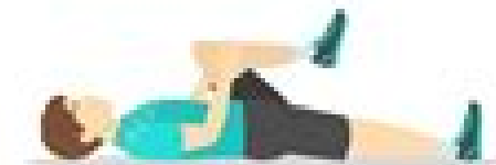
11 THIGH HUG