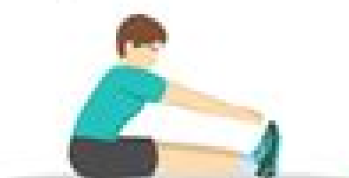
7 TOE TOUCH