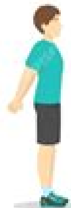
5 CHEST STRETCH