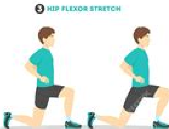
3 HIP FLEXOR STRETCH