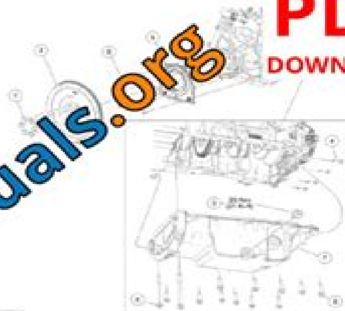
Fig. 46: Exploded View Of Drive, Flashed & Crankshaft Rear Seal With Torque Specifications Courtesy of FORD MOTOR CO.