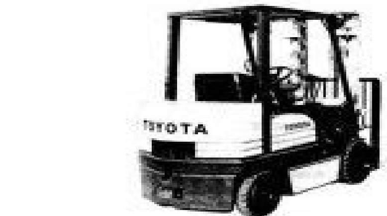
Vehicle Rear View