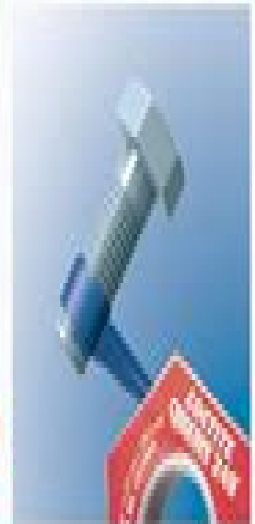
For pre-applied applications

Important Note from Loctite®: To achieve optimum performance, all parts must be clean and free of contaminants (e.g., oil, grease)