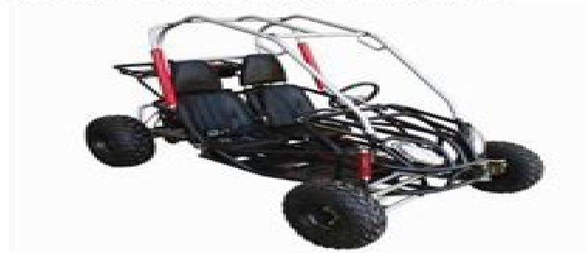
BR150S Howhit Baja Reaction 150cc Go Kart (VIN PREFIX L6K)