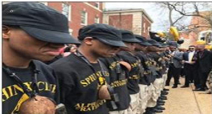
New member presentation of Alpha Phi Alpha Fraternity, Inc., Beta Chapter, on Friday, April 7.