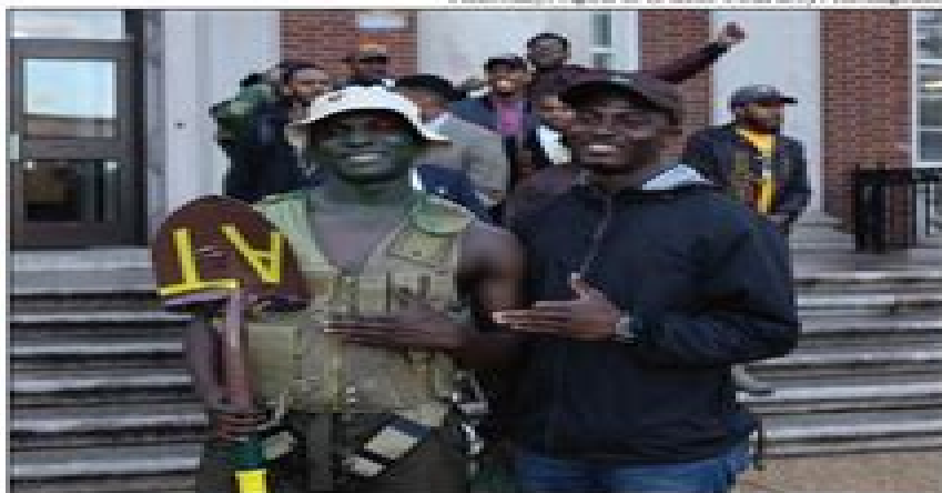
New member presentation of Iota Phi Theta Fraternity, Inc., Alpha Tau Chapter, on Thursday, April 6.