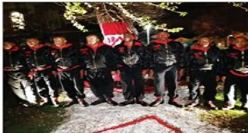
New member presentation of Kappa Alpha Psi Fraternity, Inc., Xi Chapter, on Thursday, April 6.