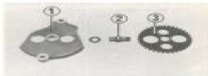
Fig. 15 (1) Oil pump-gear cover (2) Drive gear shaft (3) Drive gear

Copyright © 1997 Dodge Motor Co., Ltd. 1997