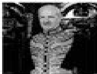
Member of the Government of Alberta

Here is page 1 to give you writing. Begin writing your news article on page 2.