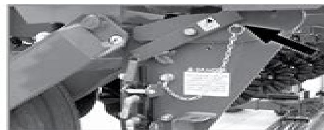
Transport latch locking pin installed