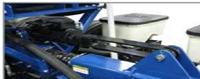
Wing lock engaged