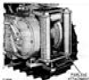
No. 1225 Power Winch

Your crawler may be equipped with a John Deere No. 1225 Power Winch. This winch is driven from the rear of the crawler and has a separate hydraulic control.