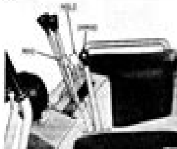
Power Winch Control Lever

To release the cable, move the control lever rearward to the "WIND" position. This allows the cable drum to "free-spin" and rotate.