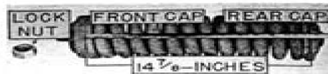
Fig. 44 — View showing the pre-load setting of the tension spring on models 440C and 440ICD. Refer to text.